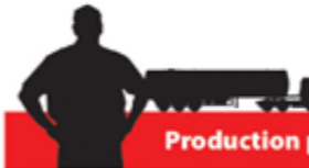
Production planning/Logistics manager

It also gives us perfect control of operations, and all the information needed for strategic decision making. This way the factory works at its maximum capacity and quality for the lowest running costs. Lowest lifetime costs, too, since the automation software lasts as long as our plant's mechanical equipment.